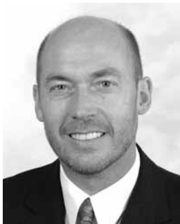
JERRY WELLER R-Morris 11th District