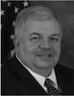
PHIL HARE D-Rock Island 17th District