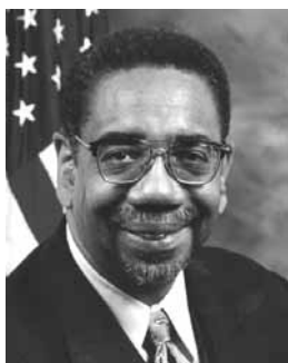
BOBBY L. RUSH D-Chicago 1st District