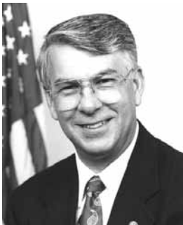
DONALD A. MANZULLO R-Egan 16th District