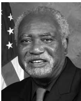
DANNY K. DAVIS D-Chicago 7th District