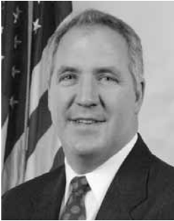
JOHN M. SHIMKUS R-Collinsville 19th District