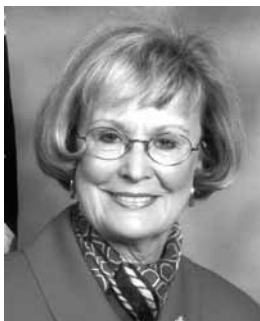
JUDY BIGGERT R-Hinsdale 13th District