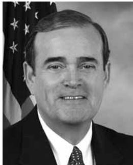
JERRY F. COSTELLO D-Belleville 12th District