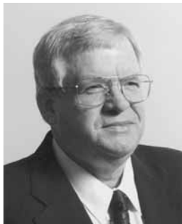
J. DENNIS HASTERT R-Yorkville 14th District