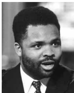
JESSE L. JACKSON, JR. D-Chicago 2nd District