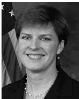
MELISSA L. BEAN D-Barrington 8th District