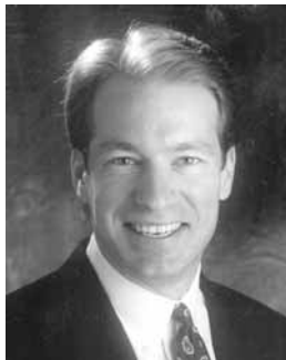
PETER J. ROSKAM R-Wheaton 6th District