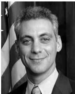
RAHM EMANUEL D-Chicago 5th District