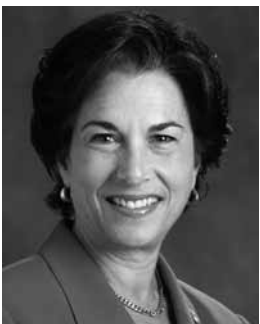
JANICE D. SCHAKOWSKY D-Evanston 9th District