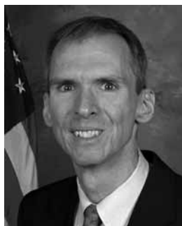
DANIEL LIPINSKI D-Chicago 3rd District