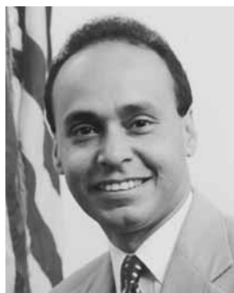
LUIS V. GUTIERREZ D-Chicago 4th District