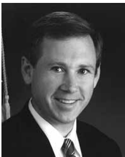
MARK STEVEN KIRK R-Deerfield 10th District