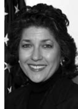
Ellen Mandeltort Deputy Attorney General Criminal Justice