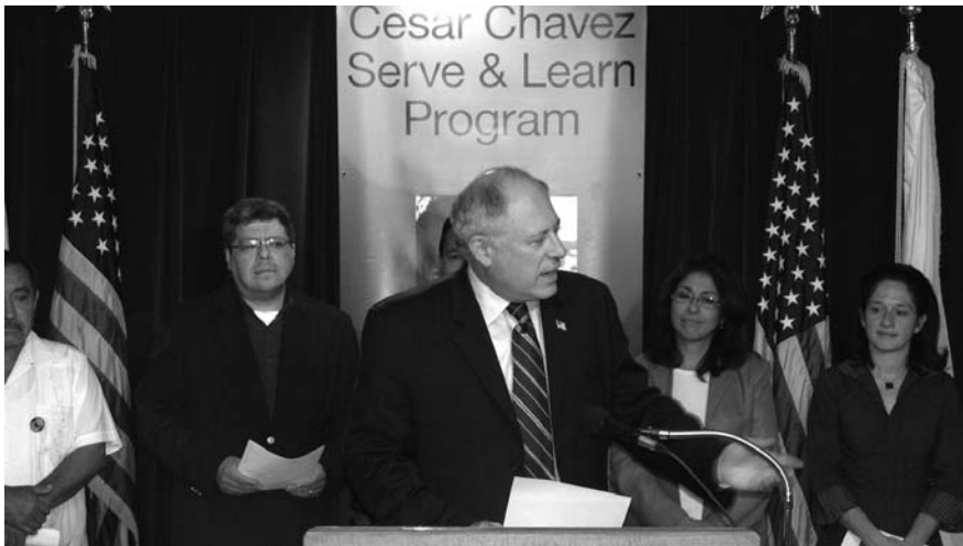
Lt. Gov. Quinn celebrates the 40th anniversary of the United Farm Workers Grape Boycott started by Cesar Chavez.

As chair of the Governor's Rural Affairs Council, Lt. Gov. Quinn leads a group of government agencies, academic institutions and rural advocacy groups dedicated to improving the economy, environment and health of Illinois' rural communities. Created in 1986, the council provides a link between state and local government agencies to support innovative rural development initiatives, and champions public policy changes that help rural Illinois.