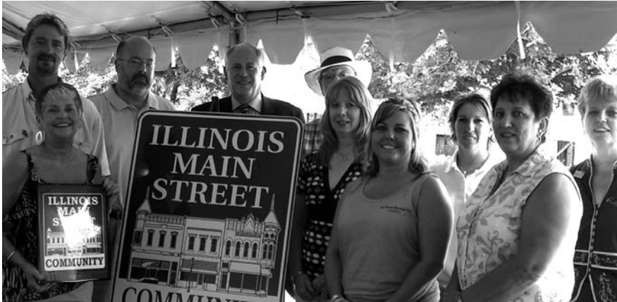
Lt. Gov. Quinn announces designation of DuQuoin as an Illinois Main Street Community.

increase high-speed Internet access across Illinois. Lt. Gov. Quinn chairs the council, which helps state agencies find innovative ways to make competitive and affordable Internet technology universally available to Illinois residents.