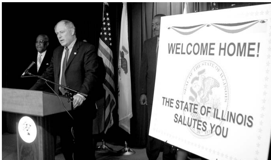
Lt. Gov. Quinn welcomes home Illinois military troops.

Lt. Gov. Quinn also leads Illinois' efforts to honor fallen soldiers and their families. Each year, the Lieutenant Governor's office sponsors the Gold Star Mother's Day ceremony, presenting memorial Gold Star banners to the mothers of servicemembers who have died while on active duty. The Lieutenant Governor's office also created the Portrait of a Soldier memorial, a series of hand-sketched portraits of Illinois military men and women killed in the line of duty since the beginning of the Global War on Terror. The Portrait of a Soldier exhibit has traveled to communities throughout Illinois, touching many hearts along the way. For more information, visit www.IllinoisHomeFront.org .