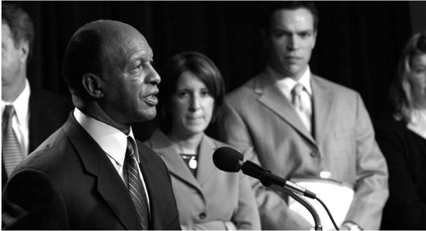
Secretary of State Jesse White announces the recommendations of his Teen Driver Safety Task Force during a press conference in January 2007. White's office drafted successful legislation based on the recommendations. The new provisions took effect Jan. 1, 2008.

offenders, as well as for persons who drive on suspended and revoked licenses. White also established a database to track court supervisions and initiated successful legislation that limits drivers to two court supervisions in a 12-month period.