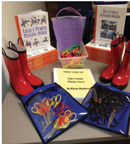
"Lilly's Purple Plastic Purse" Story Kit

Story kits are a packaged, participatory program and activity for parents and children to do together and are based on children's literature that focuses on reading strategies. Each story kit provides multiple copies of one children's book and a majority of the needed materials to implement a facilitated, literature based literacy activity for the family groups. The kits also contain a Facilitator's Guide that describes how to plan for and implement the family activity step-by-step.