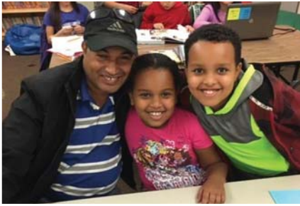
Asian Human Services