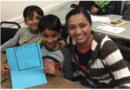
Asian Human Services