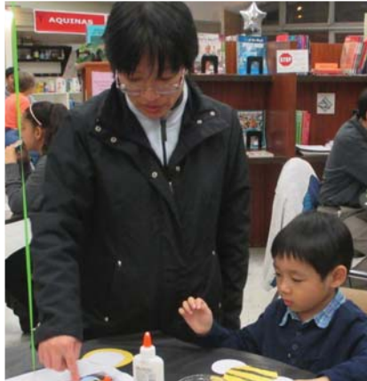
Aquinas Literacy Center