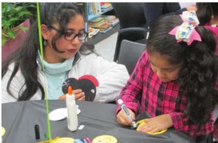
Aquinas Literacy Center