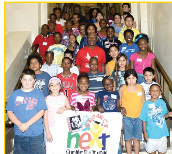
Secretary of State Jesse White hosts an annual Illinois State Fair picnic for Project Next Generation participants at the Illinois State Library.

Secretary of State Jesse White appropriates $325,000 annually for Illinois public libraries hosting Project Next Generation programs. For grant information, visit www.cyberdriveillinois.com/departments/library/grants/png.html .