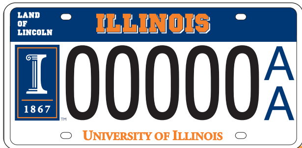
Jesse White Secretary of State