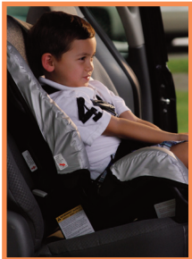
JESSE WHITE Secretary of State